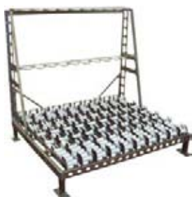
Rack to easily receive the photovoltaic panels

To meet the standards requirements, electrical supplies had to be installed and piloted by Spirale 3 in order to "put under voltage" panels during tests to carry out either continuity tests or power tests.